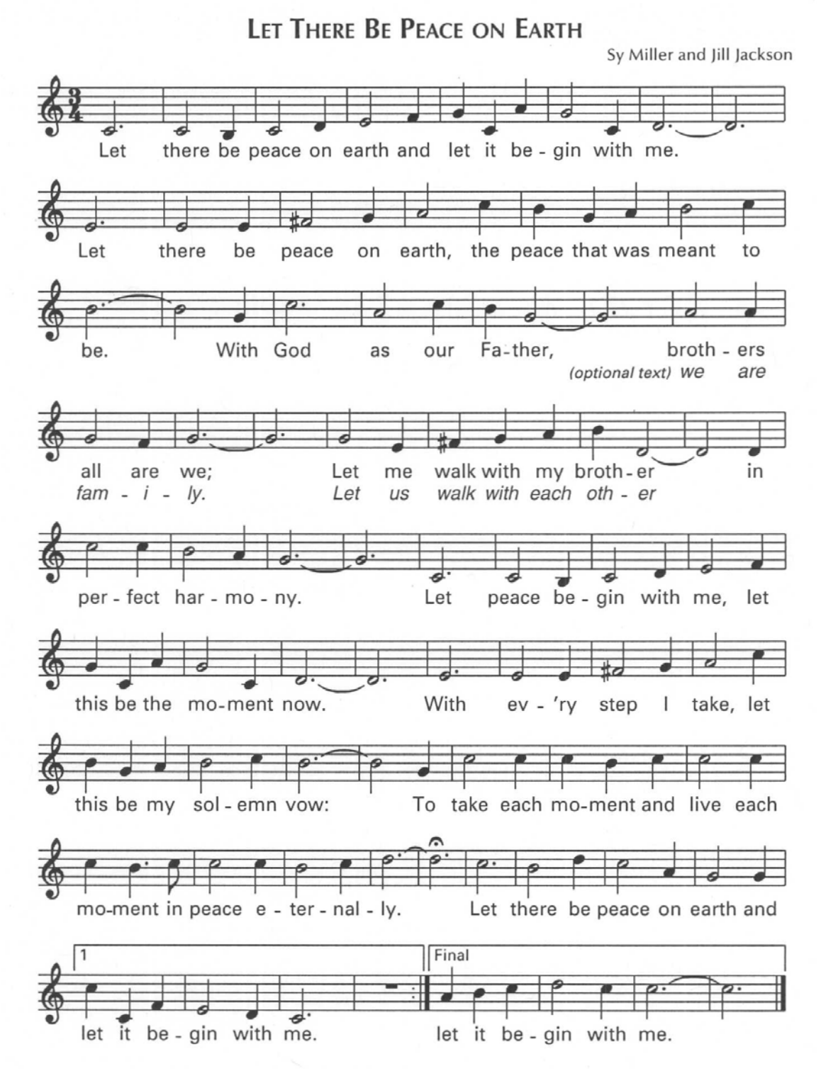
© 1955, renewed 1983 , Jan-Lee Music. All rights reserved. Used with permission.